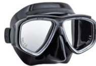
Black Silicone / Black Frame (BK/BK)