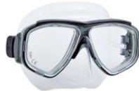
Clear Silicone / Black Frame (SK)