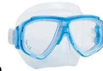
Clear Silicone / Light Blue Frame (FB)