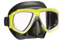
Black Silicone / Yellow Frame (BK/FY)